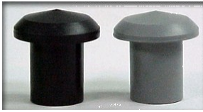
C&D Poppets for Ball Valve Company, CECO, and Hoerbiger valves.