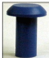
X Poppets for CECO long-stem valves.