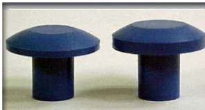
T&W Poppets for Clark (Dresser-Rand) valves.