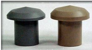
A&B Poppets for GAS Products Valves.