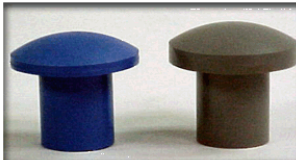
J&K Poppets for Ajax and Cooper Bessemer valves.