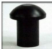
P Poppets for Ball Valve Company valves.