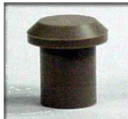
S Poppets for GAS Products high-speed compressor valves.