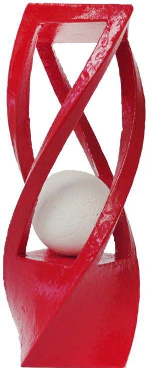
Model to illustrate printer capabilities.

ACI Services, Inc. can help you refine your part/ model file so that you get the maximum part strength without sacrificing cost.